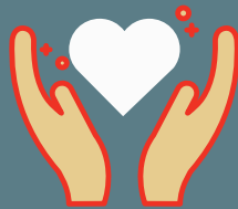
Corporate Philanthropic Initiatives