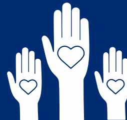
Volunteers, Friends and Supporters