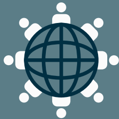
Business Networking Groups