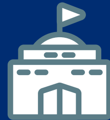
Schools and Universities