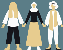
Women's Groups & Community Clubs